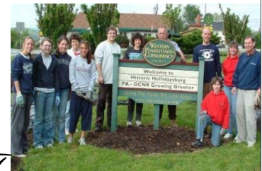
2008 volunteers at the Gateway Garden near The Dream.