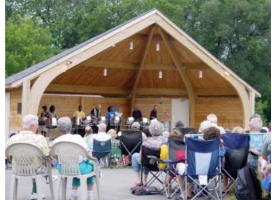
The audience enjoys a Steel Impressions concert at the Anne S. Borland Performing Arts Pavilion at the Canal Basin Park.

The Arts Council meets on the fourth Thursday of the month at 4:30 P.M. at the Municipal Building, 2nd Floor, in Conference Room B. The Public is welcome!