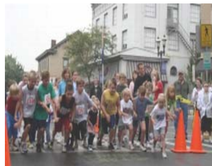
Kids line up for the Kids Fun Run in 2006.

and is $15 per each person in a family (2 to 4 entrants). Each registered racer will receive a long sleeved commemorative t-shirt.