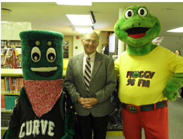
Mayor with Steamer of the Curve and Froggy of Froggy 98 Radio.