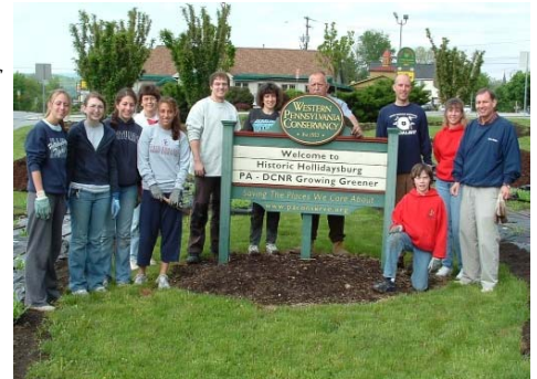
Volunteers work at the garden, spring 2008.

The entire community gets to enjoy the beautiful entrance into Hollidaysburg because of the willingness of dedicated volunteers to lend time and talents.