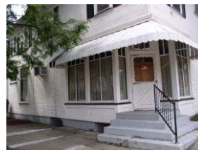
303 Jones Street.