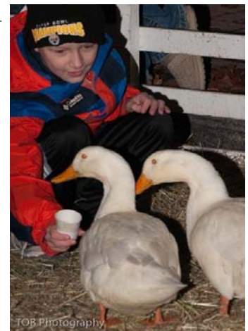
A youngster enjoys the petting zoo.