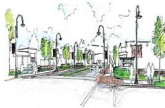
PROPOSED STREET-SCAPE FOR BLAIR STREET, LOOKING EAST.

If you have questions about the project, please contact Ethan Imhoff at 695-3880.